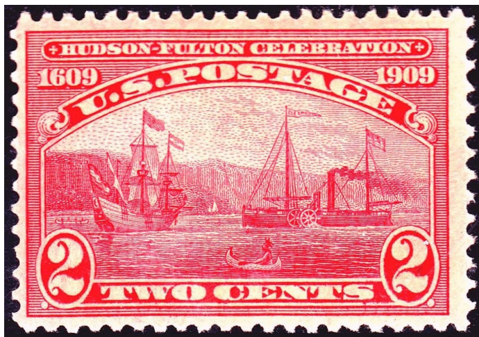
1909 Hudson-Fulton stamp

Hello, HVSF Bake-Off Playwrights! Here are some history resources to check out as inspiration for your plays. This year's theme is rich in metaphors, as rivers and deltas have been used in literature, song, and the visual arts to portray life's movements and confluences. In past years, I have directed participants to their local historical societies, museums, and libraries, to look at collections. This year, I've added more digital links because of the Covid-19 quarantine, so you can get inspiration from home, and can think more broadly and symbolically about Mahicantuck. Have a great time writing and thinking about Hudson's River, as a 19 th century map referred to it, and if you have the opportunity, go have a look at the Hudson River and let it inspire you in person. I look forward to the stories you will tell!